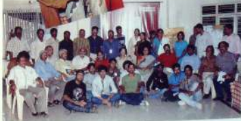
Group Photo at An Camp